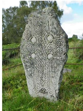
Fig. 6 Kinord Class III symbol stone.

Class III: This is a more disparate group, which is given a rather late date, overlapping in time with Class II. Class III stones are carefully shaped pieces where elaborate crosses are the main features (fig. 6). Some of them also have figural embossed scenes. Date: the late eighth and the ninth centuries.