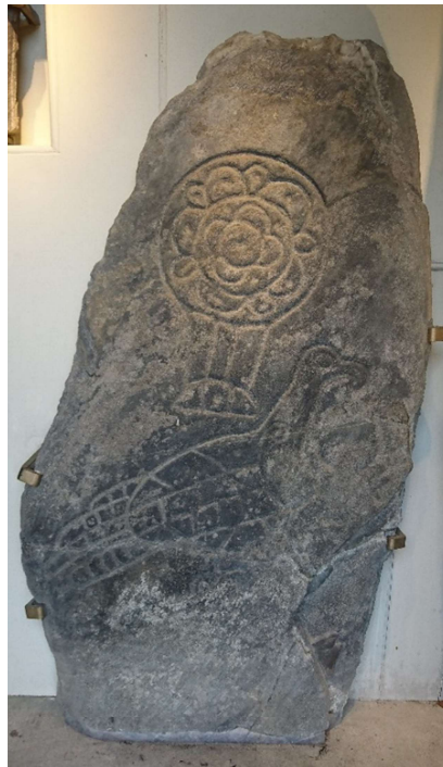
Fig. 8. One of the Class I stones at Inveravon Church, Banffshire.