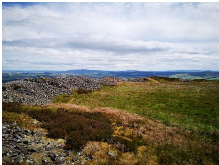
Fig. 12. View from inside the Iron Age/Pictish fort at the top of Tap o'Noth.

Tap o'Noth is a particularly interesting site, as it was only recent excavations that clearly showed that this site was extensively used by the Picts. Indeed, this site was linked to several other Pictish high status/royal sites in the immediate vicinity, such as Rhynie where an elite settlement has been excavated. In the area, there are also a number of Pictish stones that are easily accessible.