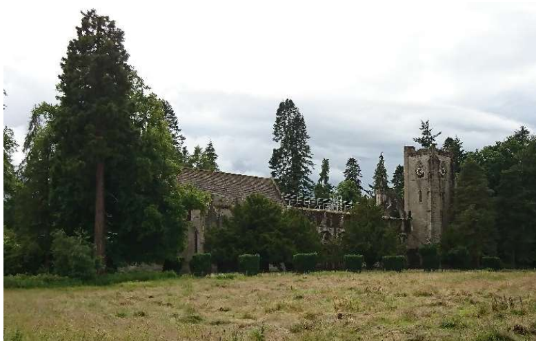
Fig. 10. Dunkeld Cathedral.

Another religious site of interest is Dunkeld Cathedral (Fig. 10), which was preceded by a Pictish monastery. The early Pictish church is now gone, but the many carved stones demonstrate its existence. These include the 'Apostles Stone', dating to the 800s. A few hundred meters north of the church is hillfort, found on the summit of King's Seat, a key geographical feature in the landscape, located on a bend on the in the River Tay. The fort's defences consist of a central citadel occupying the summit of the hill and a series of ramparts enclosing lower terraces. These sites could work well together as part of a heritage trail.