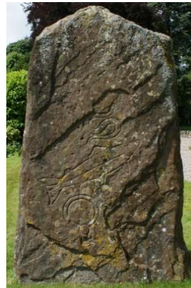
Fig. 4 Glamis Class I symbol stone.

Class I: These are erratic boulders or roughly prepared slabs of stone, decorated with groups of incised or pecked symbols, such as animals and various objects, but no crosses (fig. 4). They are seen as the earliest stones, dating from up to the late seventh century.