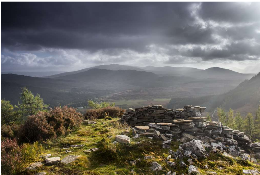
Fig. 3 Dun da Lamh hillfort.

The National Museum of Scotland (NMS) in Edinburgh has a section of the Early People gallery which focuses on the Pictish period in Scotland. The displays incorporate a wide range of artefacts from across Scotland, including highlights such as the Norrie's Law hoard , a major collection of Pictish silver discovered in Fife in the 19 th century, and the St Ninian's Isle treasure , discovered during excavations on the island in 1958. Near to the entrance to the gallery stands the main portion of the Hilton of Cadboll Stone , a late-8 th / early-9 th century Pictish stone originally located at Hilton of Cadboll in Easter Ross.