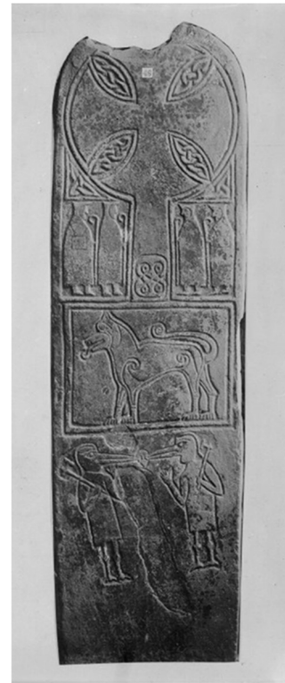
Fig. 14. The Papil Stone, Burray Shetland. This stone was found in the churchyard of Papil Kirk, where it had been reused as a grave cover.