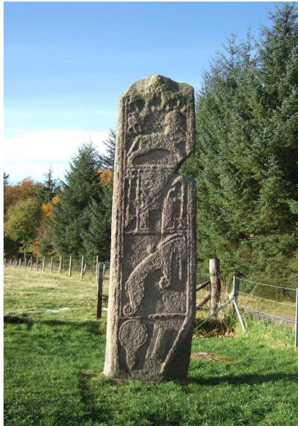
Fig. 1 Maiden Stone.

centre. Numerous individual standing stones can be found in situ across the east and north of Scotland, including the Maiden Stone , Aberdeenshire (fig.1) and Sueno's Stone , Moray.