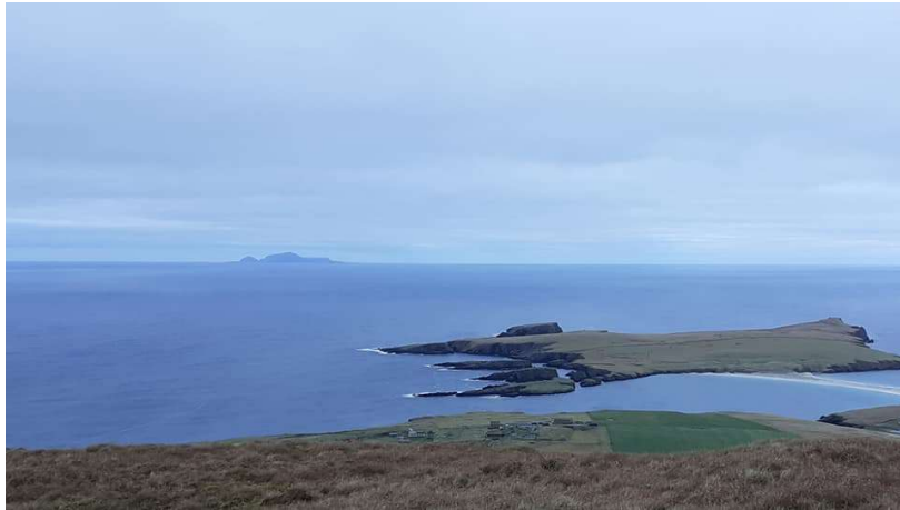
Fig. 9. View over St Ninian's Isle from the Shetland Mainland.

Another religious site of interest is Dunkeld Cathedral (Fig. 10), which was preceded by a Pictish monastery. The early Pictish church is now gone, but the many carved stones demonstrate its existence. These include the 'Apostles Stone', dating to the 800s. A few hundred meters north of the church is hillfort, found on the summit of King's Seat, a key geographical feature in the landscape, located on a bend on the in the River Tay. The fort's defences consist of a central citadel occupying the summit of the hill and a series of ramparts enclosing lower terraces. These sites could work well together as part of a heritage trail.