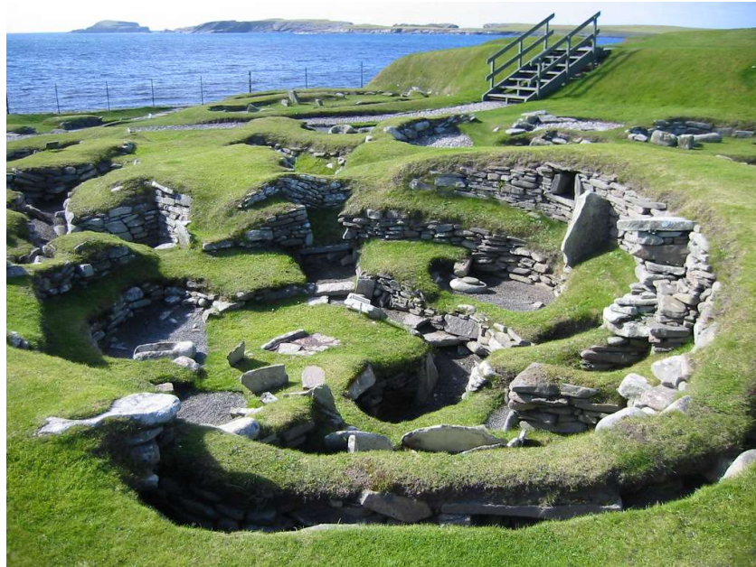
Fig. 2 Jarlshof.

The National Museum of Scotland (NMS) in Edinburgh has a section of the Early People gallery which focuses on the Pictish period in Scotland. The displays incorporate a wide range of artefacts from across Scotland, including highlights such as the Norrie's Law hoard , a major collection of Pictish silver discovered in Fife in the 19 th century, and the St Ninian's Isle treasure , discovered during excavations on the island in 1958. Near to the entrance to the gallery stands the main portion of the Hilton of Cadboll Stone , a late-8 th / early-9 th century Pictish stone originally located at Hilton of Cadboll in Easter Ross.