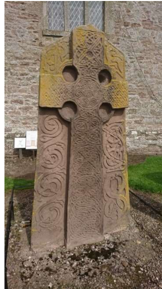
Fig. 5 Aberlemno cross-slab. Photograph: Alex Sanmark

Class II: These stones are seen to represent the next chronological phase, the coming of Christianity. Class II stones are more carefully finished slabs onto which symbols and a cross have been carved on one or both sides (fig. 5). Usually, the cross is on one side and the symbols are on the other.