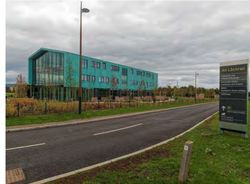
'An Lòchran Building'