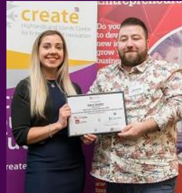
UHI Business Competition 2020